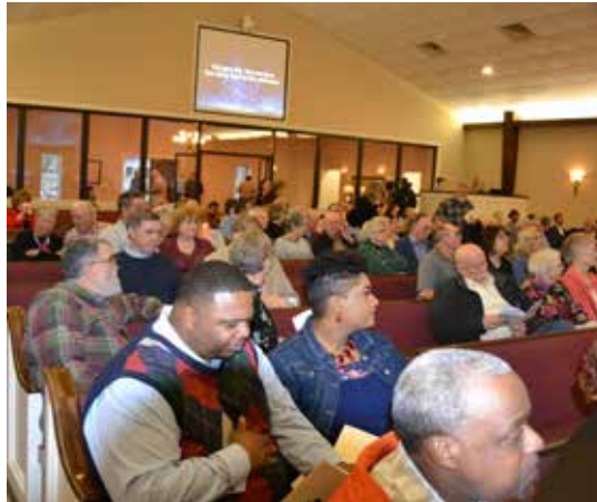
Messengers and Guests waiting for the start of the 120th Annual Meeting of SBA.