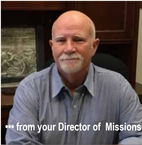
... from your Director of Missions