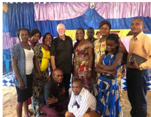
Everyone loves the Mazungu (white man).

More pictures can be viewed on our FB page SmithBaptist