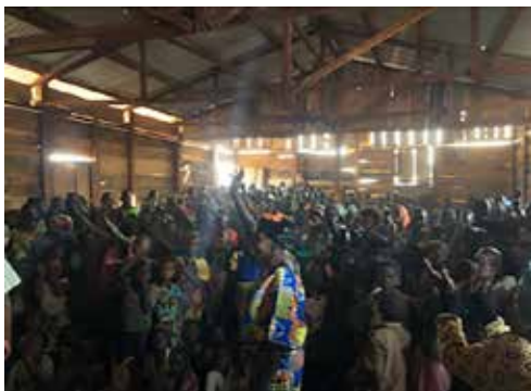
The Chapel at the Refugee Camp in Bunia. Many, many needs and not enough resources.

We went to a Chapel located in a Refugee Camp in Bunia. It was packed out inside with thousands; more outside. All were worshipping our Lord and Savior Jesus Christ. The Gospel was preached and many calling on the only name that can save. Jesus Christ. It was an amazing outpouring of God's grace. There are many stories to tell and I hope to share those with you at our Annual Meeting in January. For now, I will share a few pictures with you of some of the places we have been while on this trip. I look forward to being back in the office. If there is anything that I can help you with, please do not hesitate to call me.