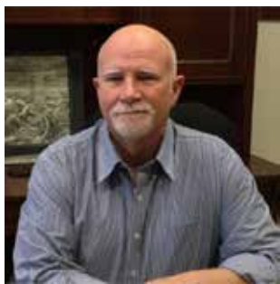
... from your Director of Missions